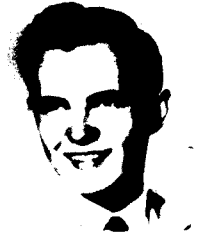
RALPH SCHMIDT Animals are such agree- able friends--they ask no questions--they pass no criticism. Eliot