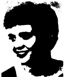
I came, I saw, I con- quered, Caesar