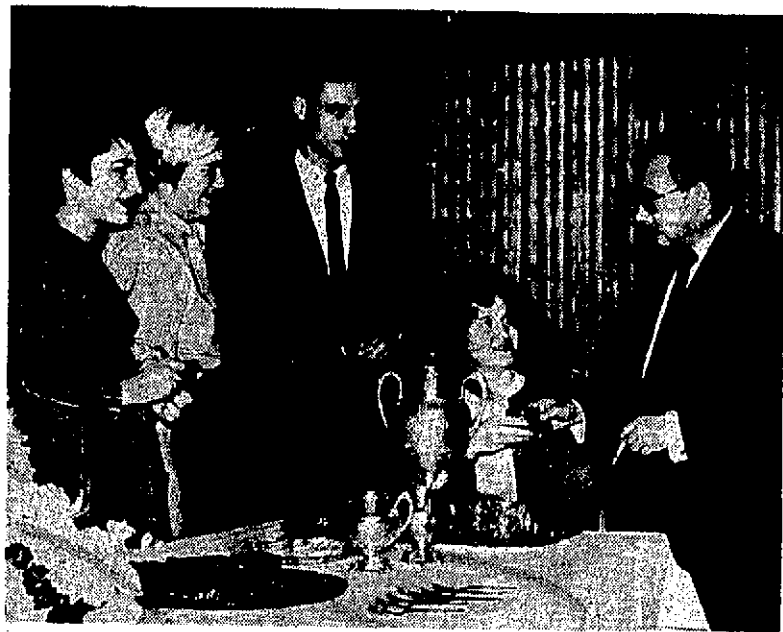
Britisher Re-Visits Coe

Beauty Salon 1532 First Ave. NE EM 2-6231